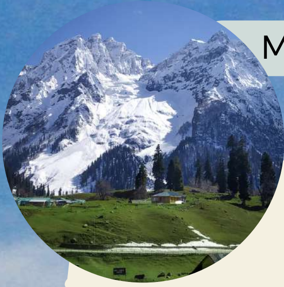
Mountains in Kashmir 4