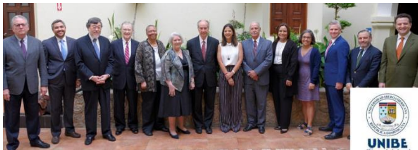
AMERICAS: Universidad Iberoamericana, School of Law Santo Domingo, Dominican Republic