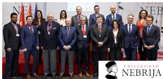
EUROPEAN: Universidad Nebrija, Department of Law Madrid, Spain