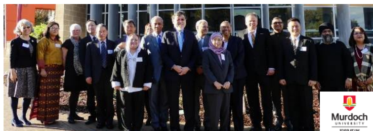
ASIA-PACIFIC: Murdoch University, School of Law Perth, Australia