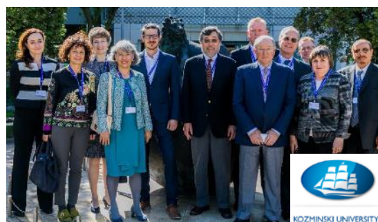
EUROPEAN: Kozminski University, Law School Warszawa, Poland