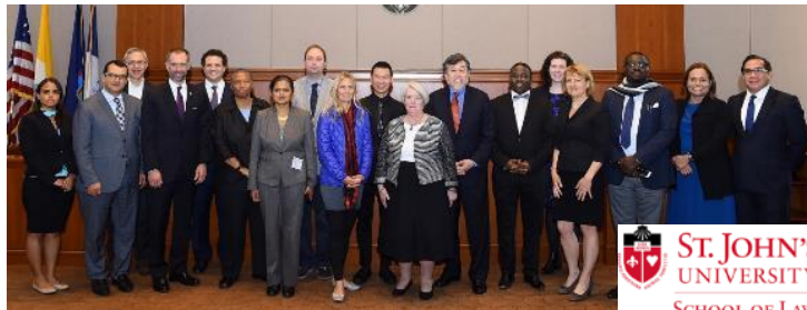
AMERICAS: St. John's University, School of Law New York, United States