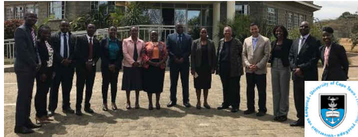
AFRICAN: University of Cape Town, Faculty of Law Cape Town, South Africa