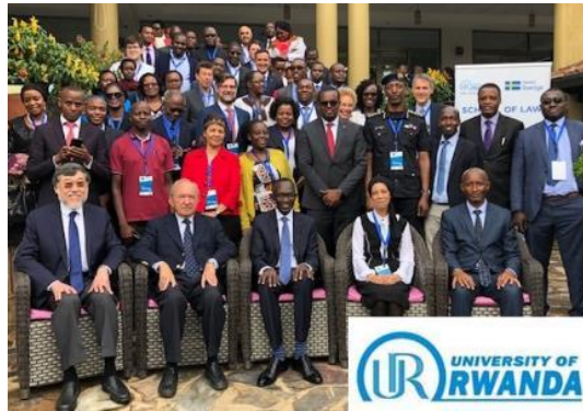
AFRICAN: University of Rwanda, School of Law Kigali, Rwanda