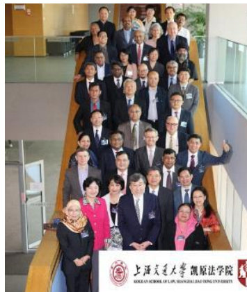
ASIA-PACIFIC: Shanghai Jiao Tong University, KoGuan School of Law Shanghai, China