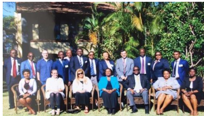
2016 African Law Deans' Forum

The University of Zambia, Lusaka, Zambia and Southern Institute for Policy and Research, Livingstone, Zambia