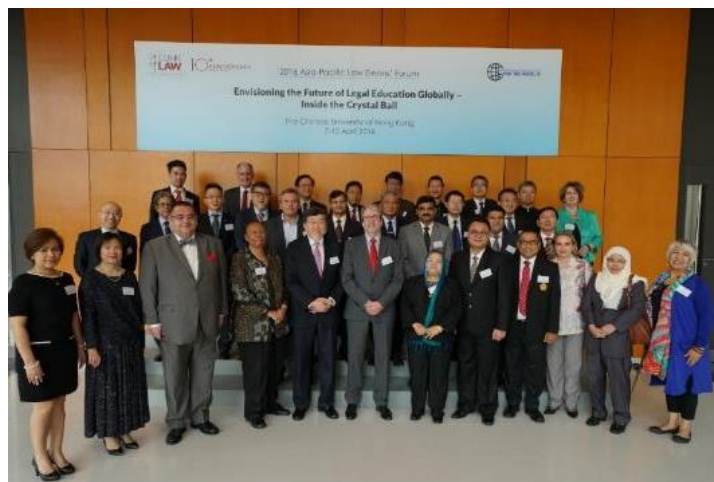
2016 Asia-Pacific Law Deans' Forum

Pontifical Catholic University of Puerto Rico, Ponce, Puerto