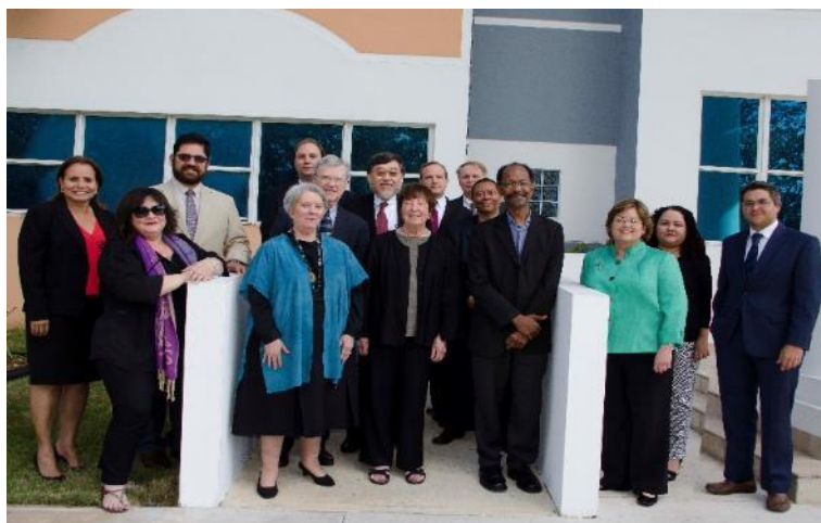
2016 Americas Law Deans' Forum

Thank you to our generous 2016 law school hosts and their colleagues in so professionally and graciously hosting the forums. Pontifical Catholic University of Puerto Rico, Ponce, Puerto Rico; Chinese University of Hong Kong, Hong Kong, China; The University of Gdansk, Gdansk, Poland; and The University of Zambia, Lusaka, Zambia in conjunction with the Southern Institute for Policy and Research, Livingstone, Zambia. Without their help, this would not have been possible.