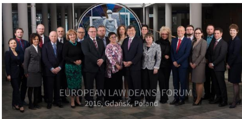
2016 European Law Deans' Forum

Chinese University of Hong Kong, Hong Kong, China