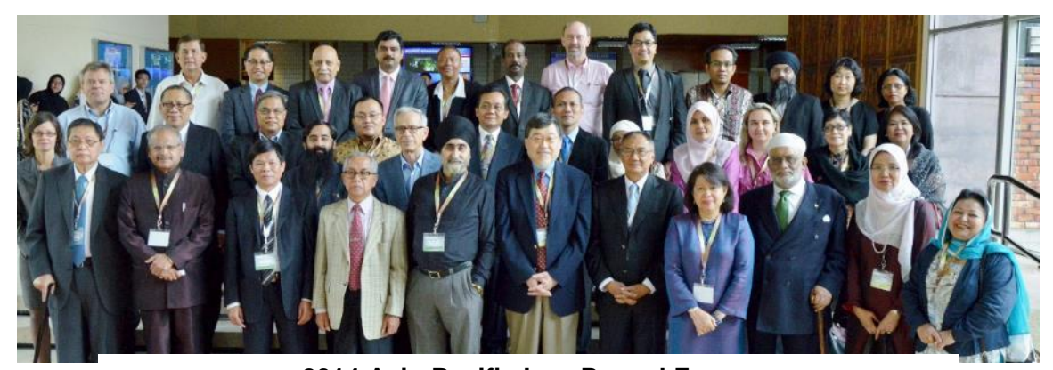
2014 Asia-Pacific Law Deans' Forum National University of Malaysia - Kuala Lumpur, Malaysia