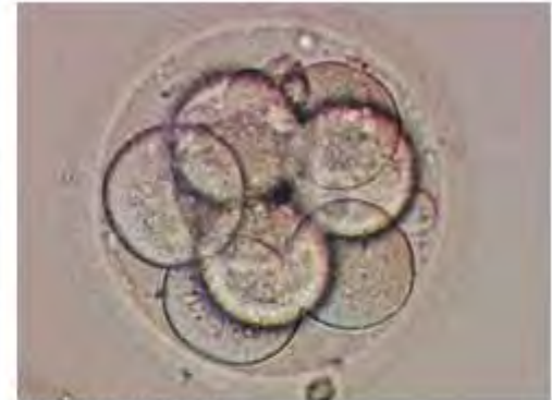
3. 8-Cell Embryo