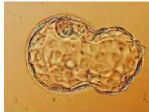
5. Hatching Blastocyst