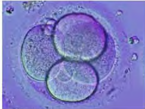
2. 4-Cell Embryo