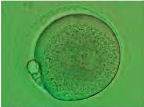
1. Fertilized Egg